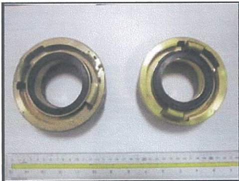
65mm hose coupling on right and 80mm hydrant coupling on left

A member has reported an incident in which replacement fire hydrants were found to be fitted with incorrect coupling sizes, leading to them being incompatible with fire hose couplings. This would have severely impacted the firefighting capabilities of the vessel. The incident occurred following a number of earlier occasions in the previous five years in which fire hydrant valves in the accommodation had been found leaking. Replacement hydrants were ordered and fitted, but the couplings were found to be incompatible. It was found that the coupling on the hydrant valve in the port side forward thruster room did not fit the adjacent fire hose coupling. The hose coupling measured 65mm and the hydrant coupling measured 80mm.