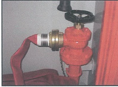
Fire hydrant with correct 65mm coupling (compatible with 65mm hose coupling)

Our members' investigation revealed the following: