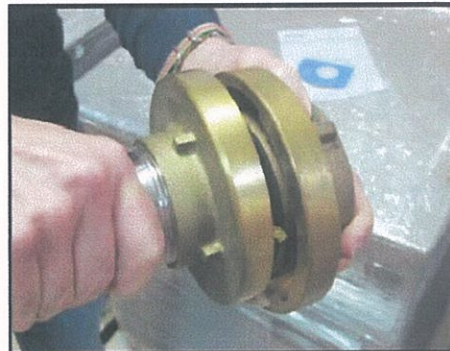
80mm hydrant coupling not compatible with 65mm hose coupling